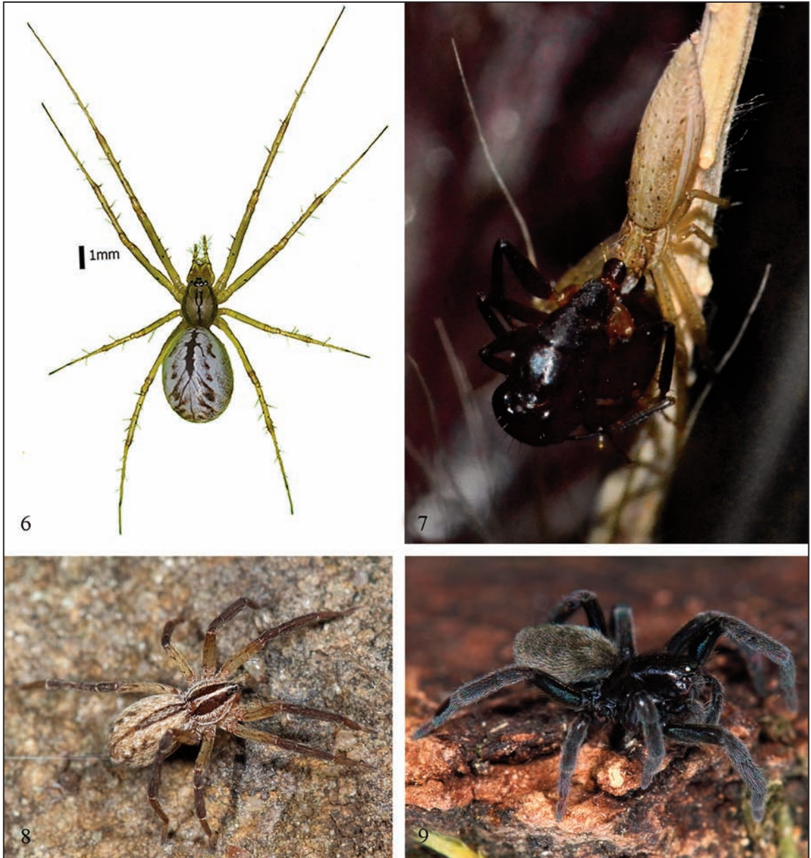
Figure 6. Lyniphia tenuipalpis female (photo by A. Dentici). Figure 7. Monaeae paradoxus preying on Camponotus barbaricus Emery, 1904 (photo by A. Dentici). Figure 8. Zora manicata female (photo by F.C. Amata). Figure 9. Titanoeca tristis (photo by F.C. Amata).