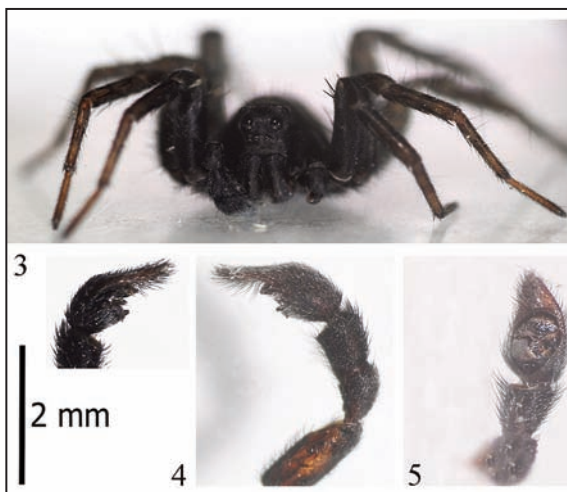
Figures 3–5. Aulononia albimana male frontal view (Fig. 3), palp lateral (Fig. 4), and frontal view (Fig. 5).

In the same area, S. florentina (Rossi, 1790) specimens were observed. In one case, the two species were observed on the cavities of the same tree, in which the S. bavarica occupied the highest and S. florentina the lowest ones.